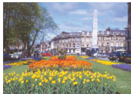
Harrogate Town Centre

Close to the Centre is the beautiful Valley Gardens and the world-renowned Royal Horticultural Society Garden Harlow Carr is a short drive away. There is so much more within easy reach – the metropolis of Leeds with its premium shopping and exciting social scene, the historic city of York, Harewood House, Fountains Abbey, Ripley Castle, horse racing and golf – these are all a short drive or bus ride away.