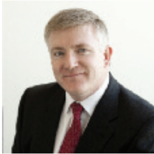
Mark Prisk MP

BIS | Department for Business Innovation & Skills www.bis.gov.uk