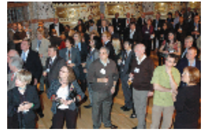
Some of the IEPC Delegates at the 2009 International Welcome Reception