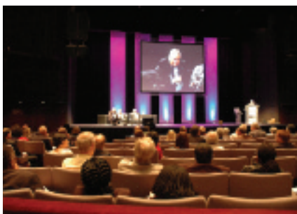
Harrogate International Centre Auditorium