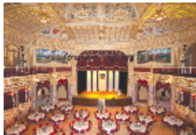
The Royal Hall